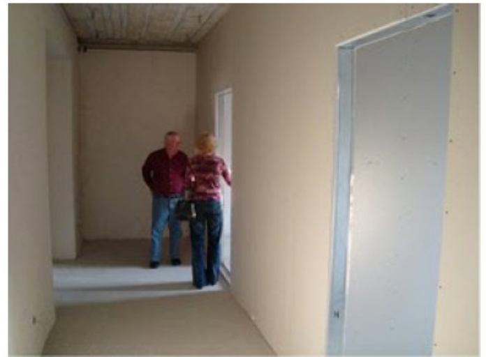
The wide second floor hallway. Future gathering place

If you would like to participate financially in purchasing and completing the building in Makeevka, please send your Name, Address, E-mail address, and let us know what level of support to RITE Canada