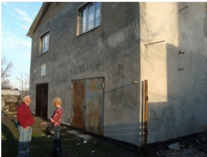
Building front: The doors to be replaced with windows

feet deep. The smaller staff is also located on the second floor. (By the way, there classroom and library is about 21 feet deep. These sizes is a window for the small dorm room just below the office. are roughly those at DCU and LOR, and are very adequate For some reason, the computer program would not show for our future needs. The kitchen facility is yet to be it.) The wide hallway in the upper part of the floor plan will designed, but what you see is the area where it is located. serve as a small gathering area for student discussions.