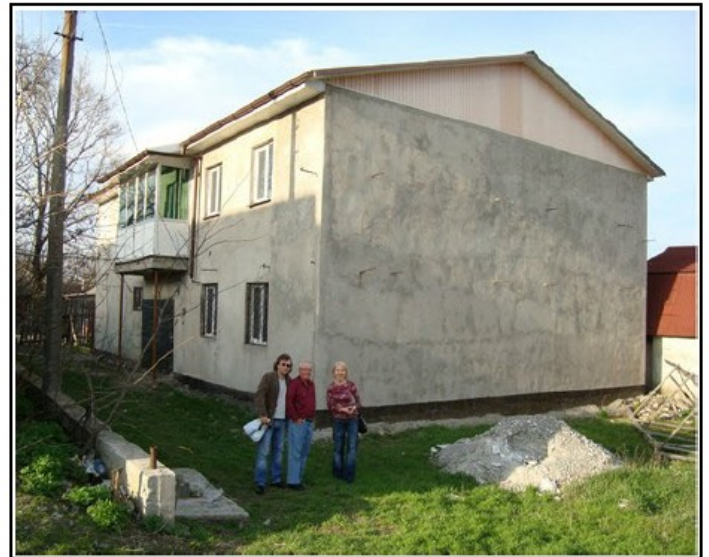
The RITE building as seen from the rear .